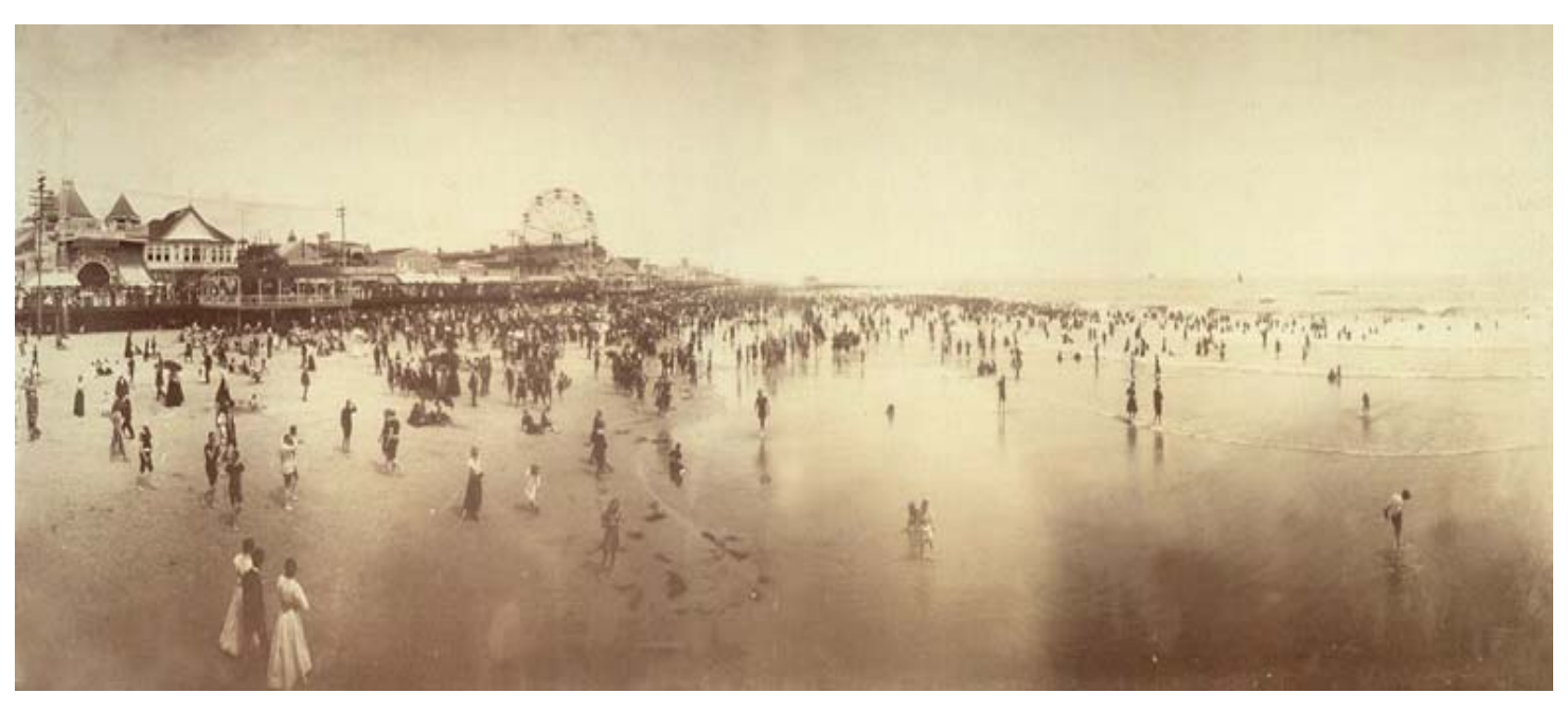
1897, Atlantic City; panorama of beach and boardwalk from pier