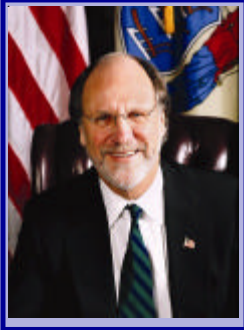
Jon S. Corzine Governor

DEPARTMENT OF THE PUBLIC ADVOCATE Division Of Rate Counsel