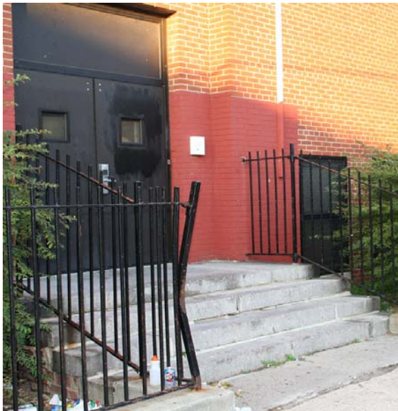
A voter using a wheelchair – or a senior citizen – who wants to cast a ballot at this Hudson County site would have to climb these four steps outside the building (above), and then an additional 11 steps inside the building (below) before getting to the polling room.

The Public Advocate found that only 20% of the visited sites passed inspection. The county VAACs, however, passed 69% of those same sites. Moreover, even where