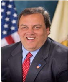
Chris Christie Governor