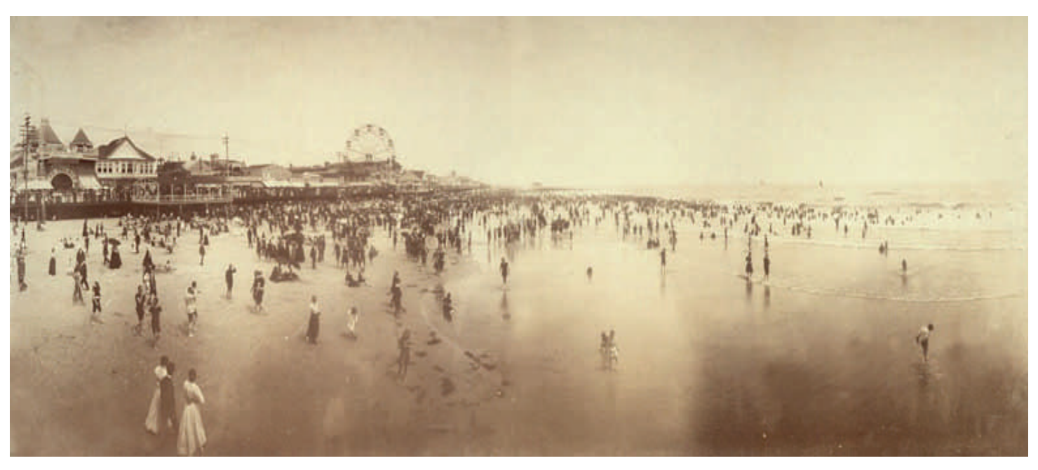
Atlantic City; panorama of beach and boardwalk from pier